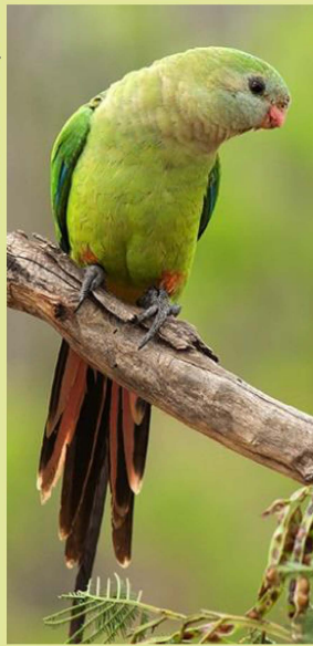
Superb Parrot Female (Polytelis swainsonii)