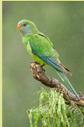
Superb Parrot Young (Polytelis swainsonii)